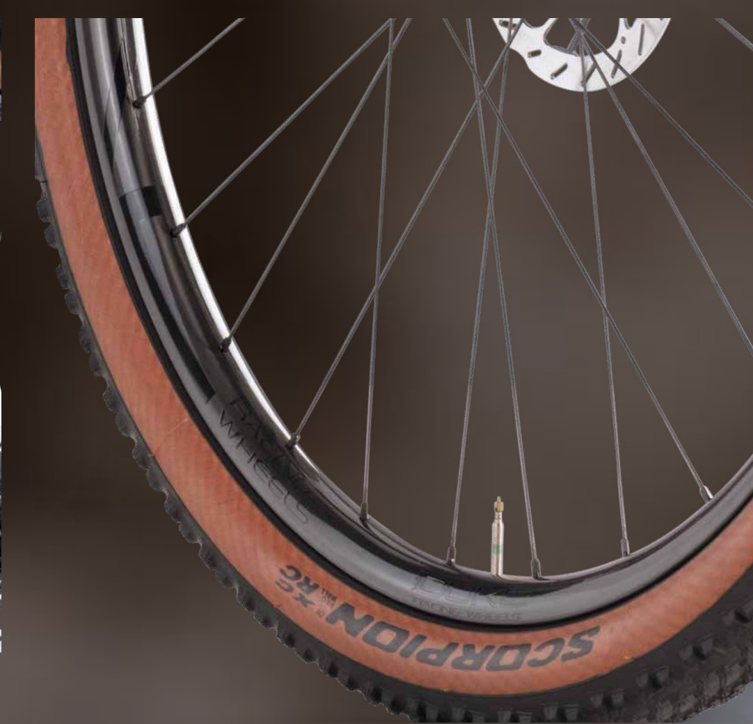
Duke Carbon Wheelset

RXC34 Carbon 120mm Fork and TXC2 Air shock with DT Swiss Remote Lockout.