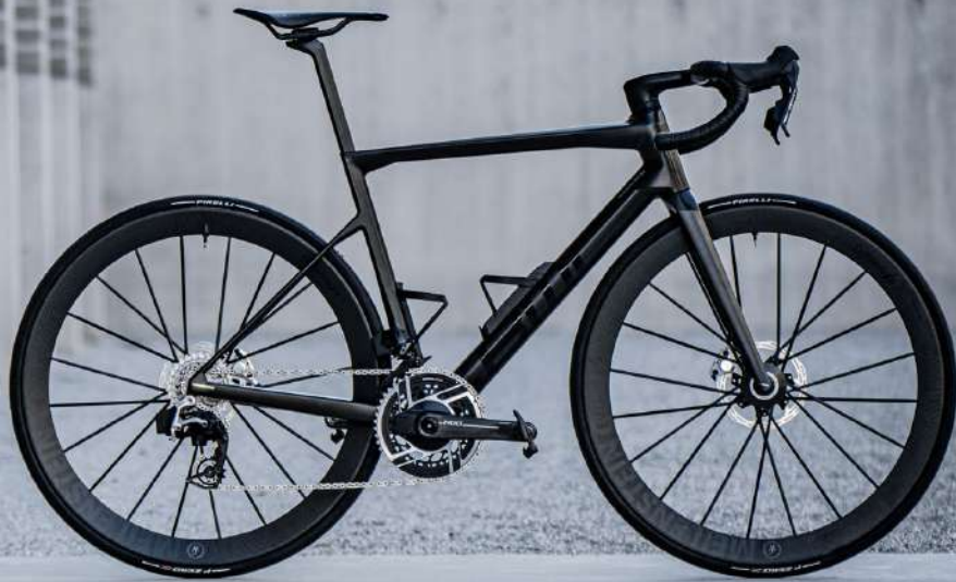
Teammachine SLR Mpc.